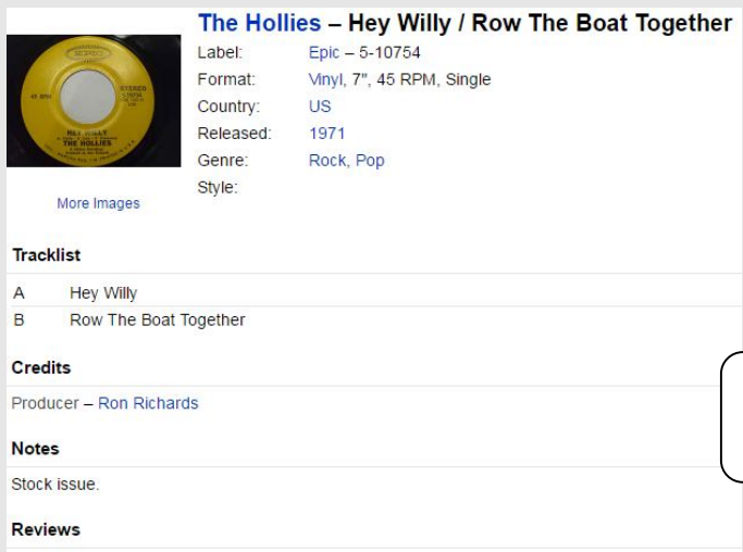
Example 1: A music album with bibliographic information